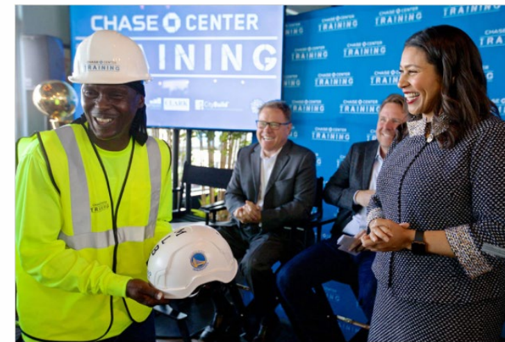
Mayor London Breed attends a graduation at the Chase Center Training class, a city workforce development program. The Office of Economic and Workforce Development has $21 million in additional funds this year intended to target inequities in the Black community including the high unemployment rate.

'Defund the police' money could address longstanding high Black unemployment rate